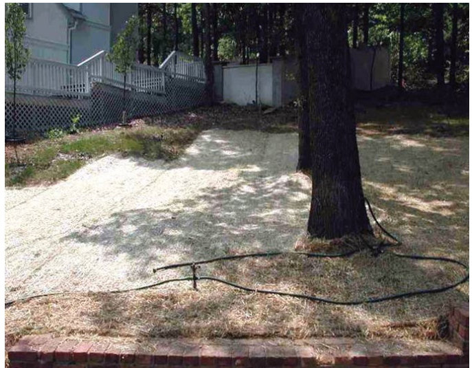
Figure 4. Various erosion control blankets can be used on slopes to help reduce erosion and retain soil moisture during establishment.

too much straw. Applying straw too thick can be detrimental to establishment and require removal after seedling germination. About 50 percent of the soil should be visible after mulching. There are many other erosion blankets available to help prevent erosion and increase soil temperature and moisture-holding capacity (Figure 4). These materials are often constructed out of jute, coconut fiber, excelsior, polypropylene and paper-based products. Some blankets are permanent, while others are to be removed after seed germination. Read and follow the manufacturer's instructions for best results.