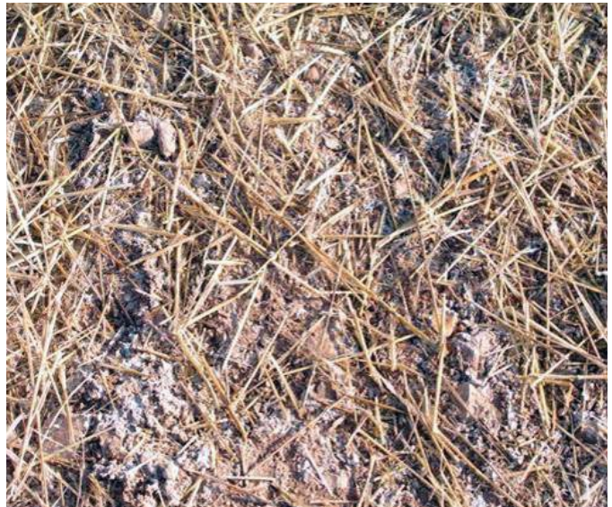
Figure 3. Straw should be applied lightly. Applying too much will shade out germinating seedlings.