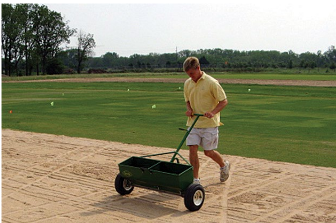
Figure 2. Seeding an area with a drop seeder.

While mulching is not essential for lawn establishment, it will help prevent erosion on sloped sites, conserve moisture and reduce seed loss from wind, birds and washing. Weed-free straw is a good choice for mulching. One square bale of straw typically covers 1,000 square feet (Figure 3). The tendency for most homeowners is to apply