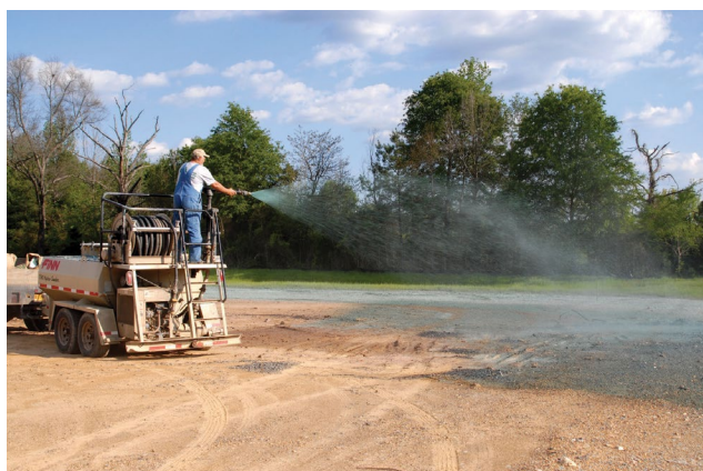
Figure 5. Arkansas lawn being established by hydroseeding.

Hydroseeding is the process where professionals apply seed in a water, fertilizer and mulch slurry (Figure 5). This process was developed in 1953 by Charles Finn in order to help establish turf on roadsides. This process is especially helpful in areas with difficult equipment access such as sloped areas. Wood- or paper-based products are typically used as a