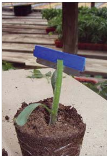
Figure 2. Preparing the rootstock with vertical cut.

If the scion is allowed to root into the soil, the plant may become susceptible to any soil-borne diseases that are present.