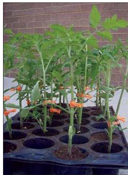
Figure 6. Tray of healing plants.

Since grafting involves making a wound on the plant, growers should be aware that wounds can provide entry sites for various disease organisms on the plant. Good sanitation should be practiced at all times when performing grafts. If the graft union is not strong enough or does not maintain good contact, stems may be disfigured and unable to support the leaves and roots.