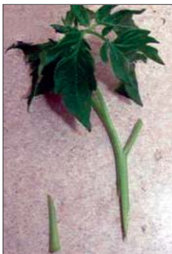
Figure 3. Preparing the scion.

When transplanting into the garden or field, it is very important to keep the graft union above the soil line to prevent adventitious roots or suckers from developing from the grafted scion. Shallow planting can help avoid these adventitious roots.