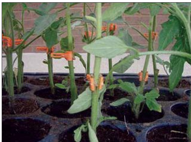
Figure 5. Healing the graft union.