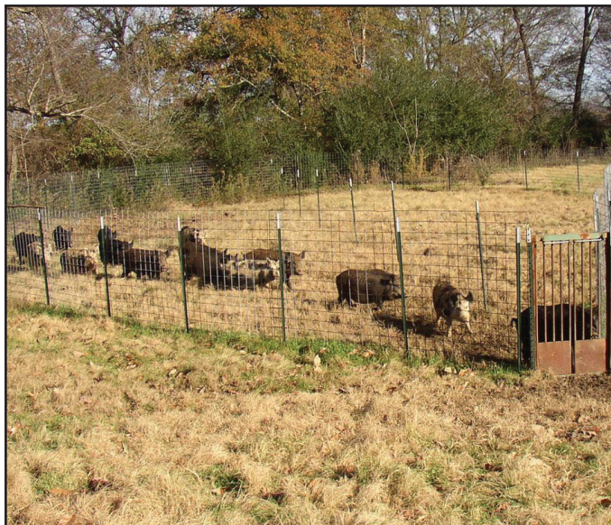
FIGURE 2. Feral hogs captured in a corral trap.