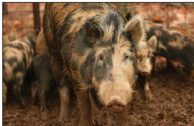
FIGURE 1. Like domesticated swine, feral hogs display a variety of coat colors as this Arkansas feral sow with piglets.

Controlling the prolific feral hog has proven difficult. Feral hogs are very adaptive and learn to avoid hunters and traps. Hogs are very mobile and